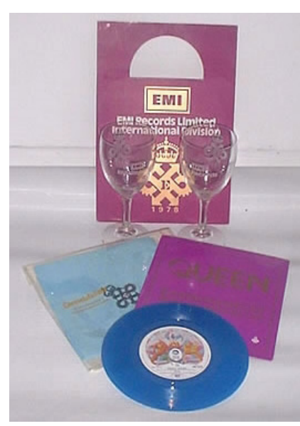
UK (The full set) EMI 2375: 3.500 €

EMI's International Division was formally presented with the Queen's Award To Industry For Export Achievement at a three-hour luncheon on Wednesday 26 July 1978, in the Cotswold Suite at London's Selfridge Hotel.. This release was pressed exclusively for this eventm strictly limited to 200 nubered copies (although there are some unnumbered copies (operatocks without picture sleeve). Some were distributed among participating EMI staff, while press kit copies were packaged in an outer 'EMI International Division' purple carrying- envelope (complete with card handles), and sent out with the luncheon's two invites. The remaining copies were presented to luncheon guests along with a pair of tall, etched champagne glasses, and a commemorative EMI silk scarf, both featuring the official 'E' export logo.