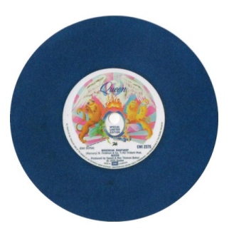
July 26th, 1978 (UK)