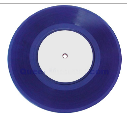
UK (white label-testpressing) EMI 2375 - no picture sleeve - Value??? Immense!!!