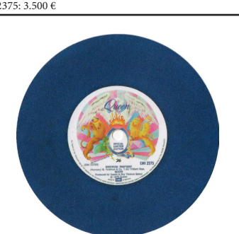
UK (unnumbered copies) EMI 2375 - no picture sleeve - overstock - 300 €