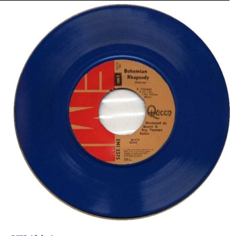
UK (fake) No-one has got this one. Just an image from the worldwiswweb...